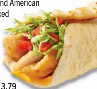
THE ORIGINAL HANI™

Premium chicken tenderloins cooked golden brown and crispy, wrapped in our own special recipe pita bread with Swiss and American cheese, shredded lettuce, diced tomatoes and mayo. 12.99 Substitute with a southwest veggie burger as a delicious vegetarian option for 1.99