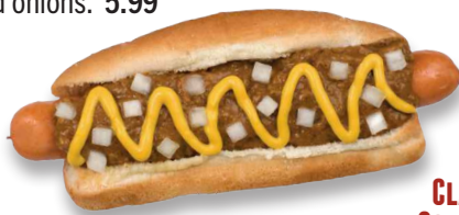
CLASSIC CONEY DOG

Melted cheddar cheese, freshly chopped bacon and sautéed onions. 5.99